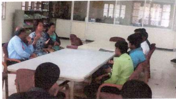
At the departments: Verification of the documents and Interaction with the faculty members