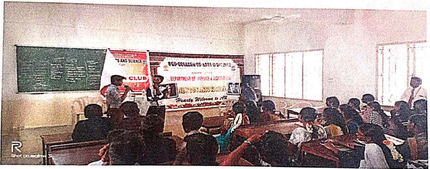
(Photo: Students involving on the spot topic like how to avoid unwanted friendships)